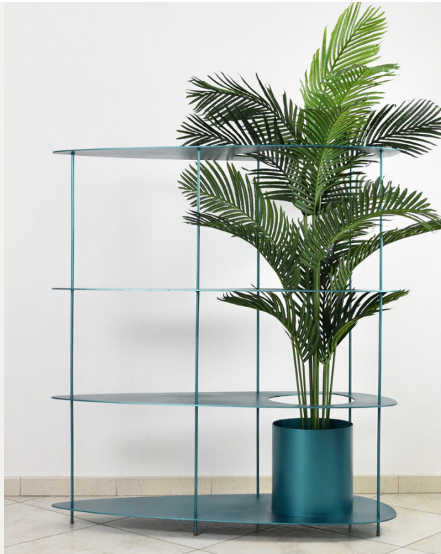
WM Metal Design